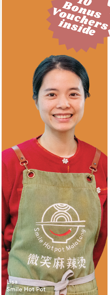
Lisa Smile Hot Pot