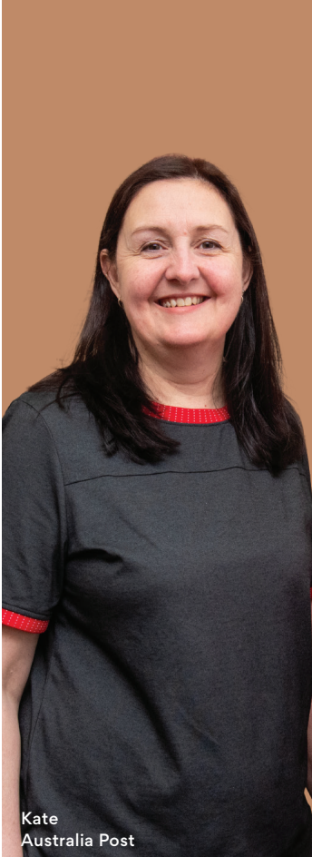
Kate Australia Post